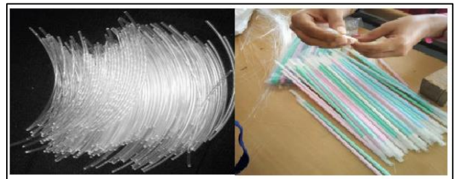
Figure 1: Optical Fibers

Versatility: Optical fibres find applications beyond telecommunications, including medical imaging, sensing, and industrial instrumentation. Their versatility makes them indispensable in various fields, driving innovation and technological advancement.