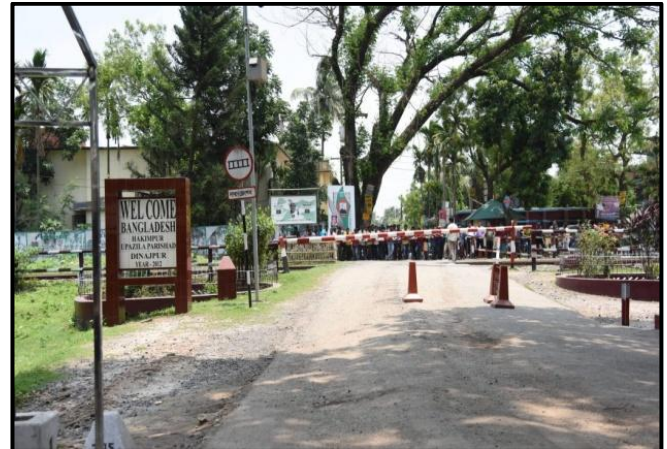
Hili (India) and Bangladesh Border