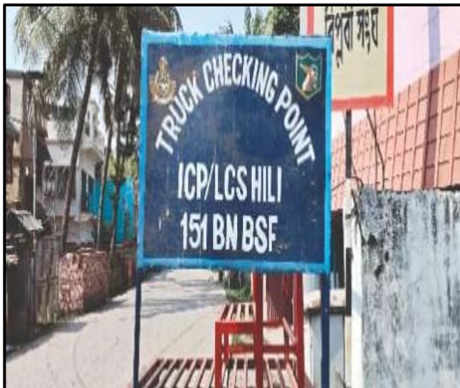
Tuck Checking Point, Hili, India