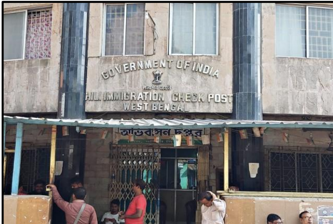
Hili Integration Check Post (Govt. of India)

Order trade has significantly influenced the socio-economic structure of South Dinajpur district. It has increased employment opportunities, improved transport systems, and encouraged market development. However, problems such as smuggling and environmental pressure remain major concerns. Proper planning, infrastructure development, and government support are necessary to ensure sustainable development in the border region.