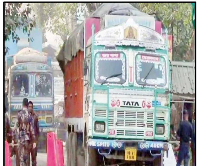
Truck passing the international Border