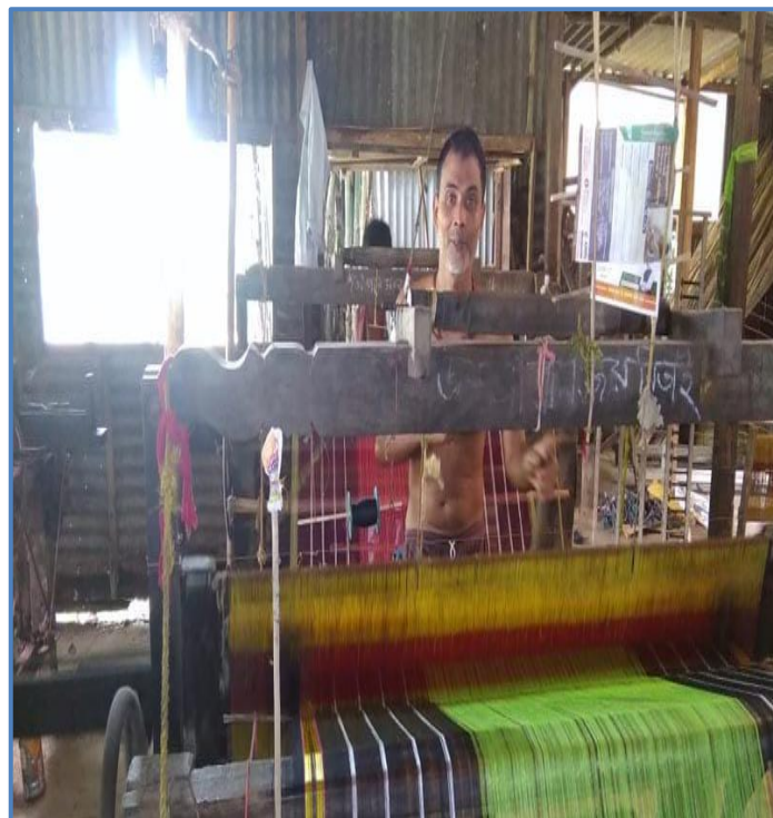
Handloom Industries, Gangaraqmpur, South Dinajpur