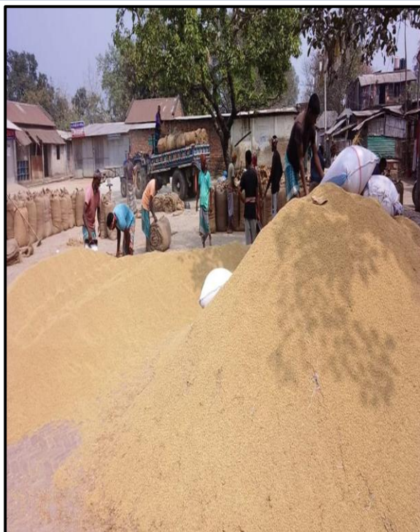
Paddy Market, Fulbari, South Dinajpur