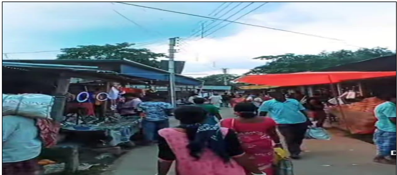
Sorai Hut, Buniadpur