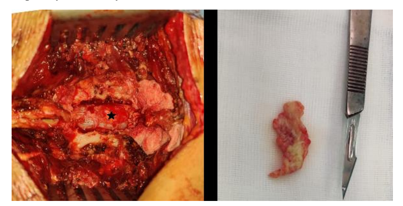
Figure 2: Intraoperative photograph of the lesion posteriorly adherent to the thecal sac after the laminectomy and its size after resection compared to a n°11 knife blade.

the thecal sac leaving a print on it after its excision. The histopathological study of the piece confirmed disc material. The patient symptoms improved and was sent home 2 days after.