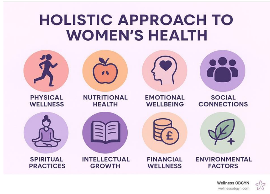
Fig 1: Conceptual Integration of Obstetric–Gynaecological Care with Materia Medica Perspectives